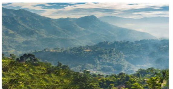
Netarhat Hill Station