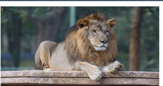
Bhagwan Birsa Biological Park